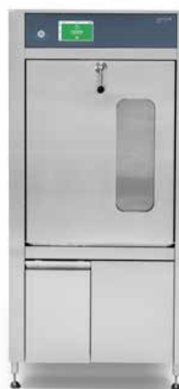
Getinge Lancer model 1400 LXP labware washer; shown with optional View-In-Process (VIP) window.