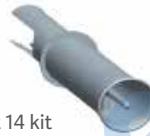
Adapt 14 kit